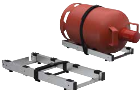
Transport safety device BASE