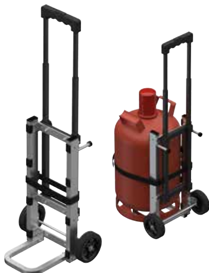
Transport safety device TROLLEY